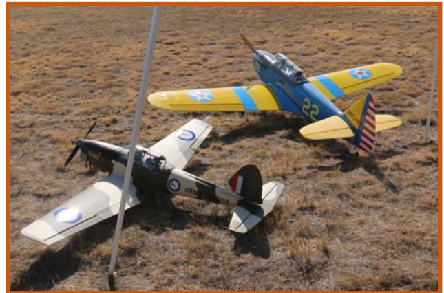
“I brought my Chipmunk & PT-26.”

The weather was great, almost too warm by the afternoon but flying continued throughout the day without any incidents or crashes, at least while I was there.