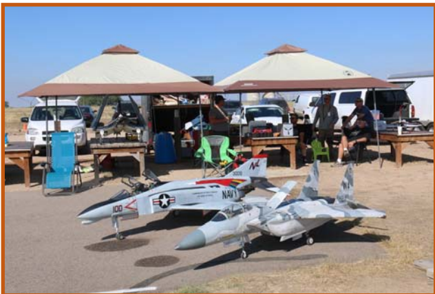
“F-4 and F-15 sitting pretty in the sun.”

There were lots of WWII airplanes to view but surprising, there were also about 12 turbine jets participating. All of them looking good.