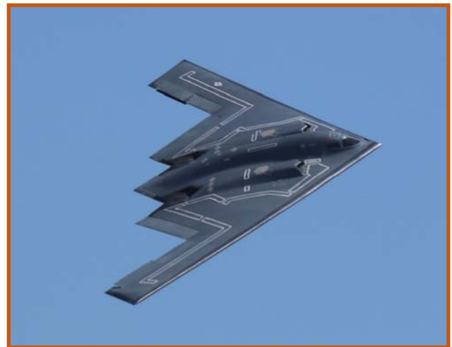
“The show of the day was this large-scale, turbine powered B-2 bomber. We were just waiting for a miniature nuclear bomb to drop out!”

The weather was great, almost too warm by the afternoon but flying continued throughout the day without any incidents or crashes, at least while I was there.