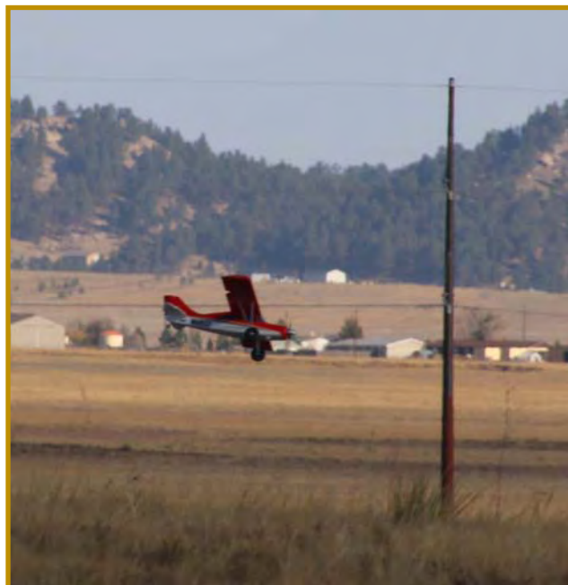
“The winds really tossed this plane around, but the pilot got it back to the runway ok.”