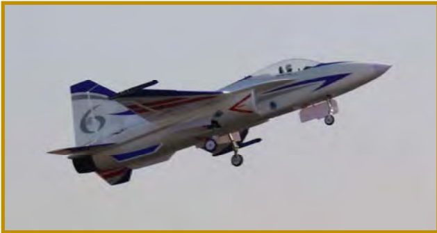
“The jet event was open to EDF (Above) & turbine (Below) powered jets.”

PPRCC hosted another successful jet event in September. What constitutes a successful event? No crashes, no injuries and everyone had a good time! It was good flying weather, but only 11-12 pilots participated. Probably because at the last minute, the Love-Air RC club up north decided to conduct a jet rally during the same weekend.