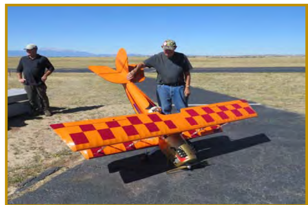
“Same plane - Keith’s Jenny top two photos / Duane’s Jenny bottom two photos.”