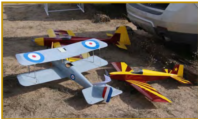
“Two of the three planes shown here were sold.”

A mini swap meet was also held in conjunction with the meeting. Several planes were up for sale and several planes were sold. And yes, despite the wind, there was some flying going on too.