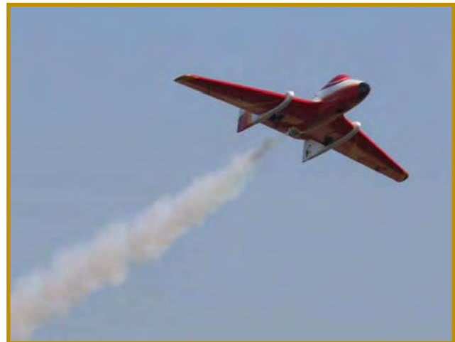
“PPRCC member Dan Brunson's turbine jet presented a nice smoke trail in the blue sky.”