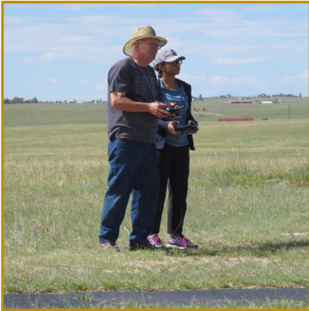
Above - PPRC flight instructor has remained busy throughout the summer, introducing and training youngsters interested in learning to fly RC planes.