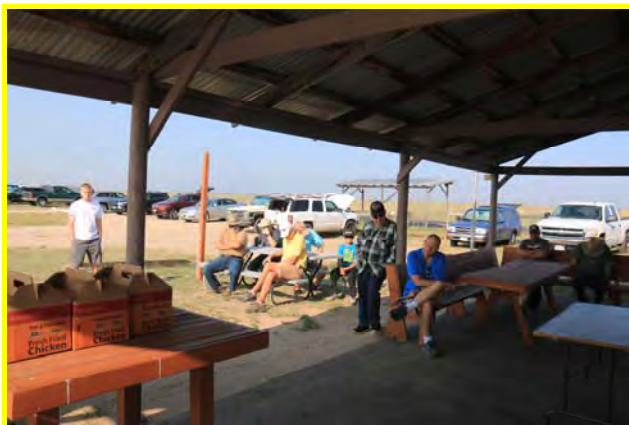
“Early club member arrivals for the Sunday morning club meeting.” +++++