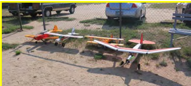
“Just a snapshot of the many planes for sale.”

On the ground there were plenty of airplanes, engines and RC accessories looking for a new home. I am not sure how many deals were made that day but there were plenty of happy faces carrying newly purchased items to their vehicles.