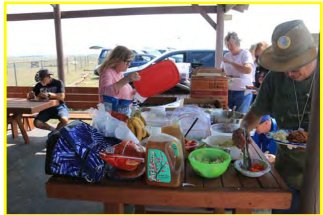
“Fried chicken was the main course with a large selection of side dishes; salad, fruit, brownies, cake, etc.”

At the lunch table, the food was plentiful and the lines were long. Many PPRCC members brought in side dishes and drinks to share with everyone. Several of the dishes were homemade and were fantastic! There were a few moments when everyone had to hold down their plates because of wind gusts, but no one lost their lunch!