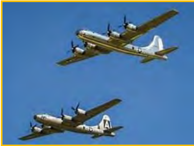
“The world’s only two flyable B-29 Superfortress’ FIFI (Left) and DOC (Right) flying at the 2018 EAA Airshow in Wisconsin.”