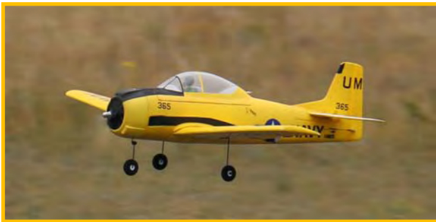
"PPRCC member Ben Woofter's yellow T-28 was one of the easier planes to spot early that morning."

The event was open flying to all electric type airplanes, helicopters or whatever flew with an electric motor. There were a few unique designs, a few gliders and even one gyrocopter that flew that day.