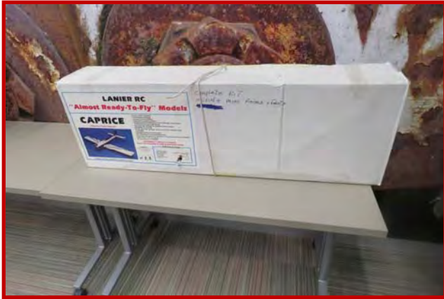
"A rare Lanier Caprice ARF was available for sale. This was a very popular ARF during the 1980's."

The PPRCC quarterly swap meet was held during the February club meeting and plenty of items were brought in for sale, to trade or for free, looking for a new home.