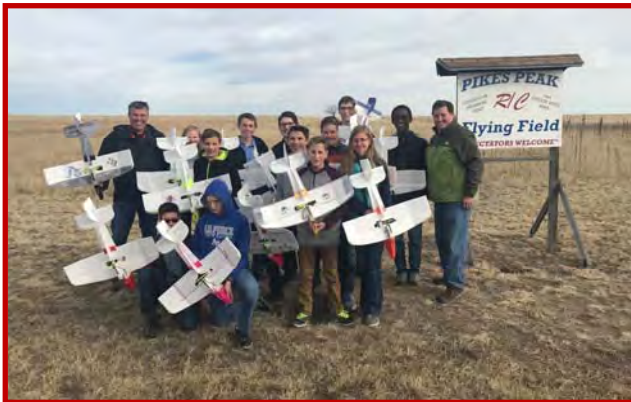
"I am not sure if the photo was taken before or after the test flights, but everyone looks happy!"

All of the young pilots are AMA registered, free membership because of their ages.