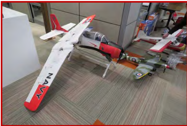
"This nearly brand new Horizon Hobbies large T-28 Trojan, with two batteries was sold for a fantastic price of $200!"