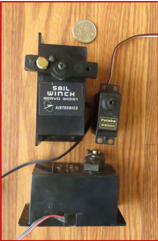
“Airtronics 94581 servo (Left) compared to a Futaba 3004 servo (Right). I plan on replacing the old Airtronics servos with newer HD1501 MG servos in the Cessna 206.”

My first step in my Cessna makeover, was to pull out all of the old servos and replace them with newer ones. As I opened the flap and aileron hatches, to my amazement, I discovered four giant size Airtronics servos. I didn't know they made servos that big!