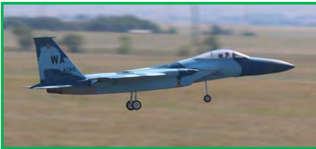
"Kevin Kinzel's F-15 Eagle about to land."

There were a full assortment of military aircraft from WWI, WWII and modern era days. The most numerous type of planes flown was the foam-electric T-28 Trojans and the larger gas-powered P-47 Thunderbolts. Surprisingly, no F4U Corsairs were flown this year.