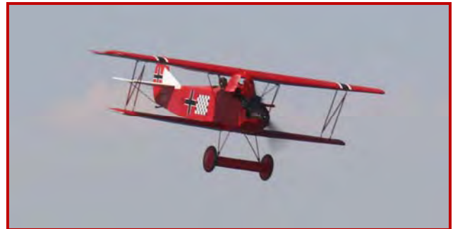
“The most popular planes of choice this year seems to be the Fokker DVII and the F4U Corsair.”