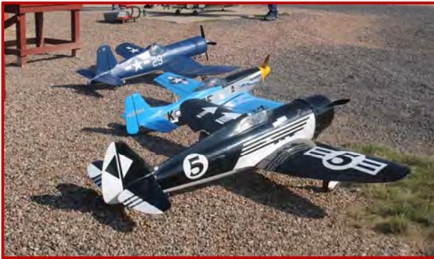
“A few of the PPRCC warbirds – Murphy’s F4U Corsair and P-47 Thunderbolt. Ben Woofter’s P-51 Mustang.”

The event kicked off around 9:00 am with about 25 pilots signing up. And yes it was the typical Pueblo weather, clear skies, sometimes breezy and of course temperatures almost reaching 100 degrees each day!