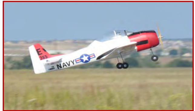
“This was the popular plane of the day, The Hanger 9 foamy T-28 Trojan. There were several of them at the airfield.”

The event was only about four hours long, taking place on the west runway, allowing non-participants to still fly on the east runway. That worked out well since the west runway had planes, jets and QUADs all over the western skies!