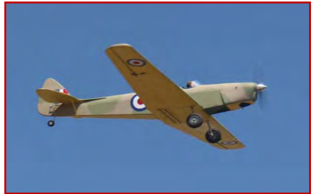
“This unique WWII British trainer, was scratch-built and flew for the first time during the Pueblo warbirds event.”