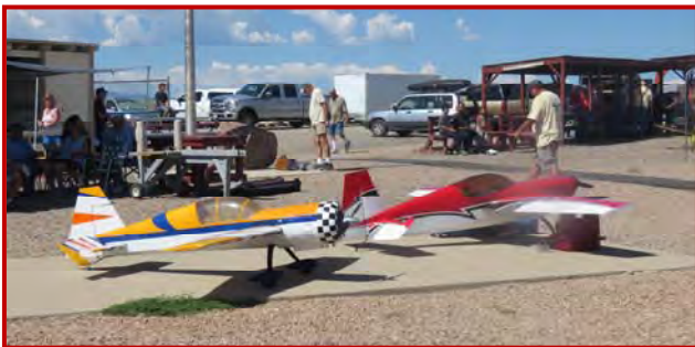
"A pair of nice looking aerobatic airplanes belonging to a few of the Pueblo RC members."

The Pueblo club served Subway cold-cut sandwiches for lunch but if you waited too long to eat your sandwich, it was probably being cooked because of the dry air and high temperatures. And some of the larger, heavier planes were noticeably using more runway for take-off and landings because of the high density altitude (DA).