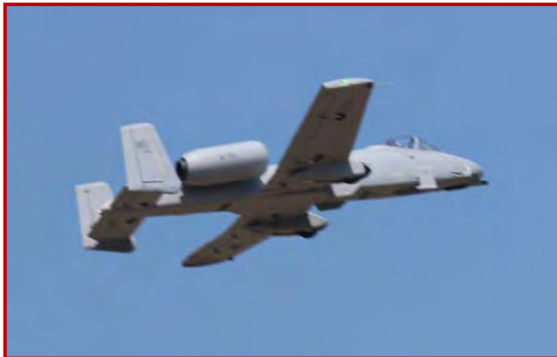
“This is the new Flightline RC electric A-10. All foam and two ducted fan engines, for the cost of $550. The owner managed about a 3 minute flight with the stock batteries.”

Much of the flying was done by 12:00 each morning because of the hot temperatures in the afternoons. With hardly a breeze at times, most pilots elected to seek shade and comfort under their tents.