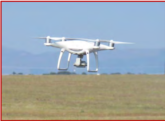
“One of the several types of QUADs that flew during the PPRCC electric event.”

One club in particular that was new to the event was a local Quad/Drone club. One of the members mentioned that they do not have a designated flying area for their equipment, so they were excited to see the PPRCC airfield. They were impressed.