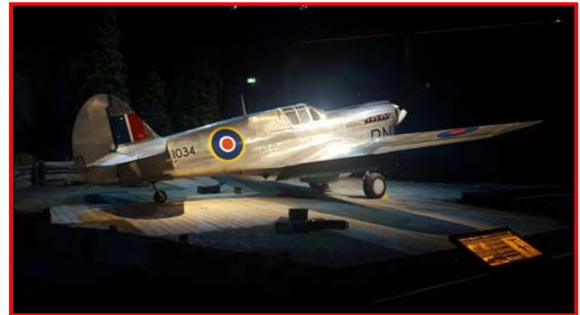
"Above: A British P-40. They were called the Tomahawk and later models, the Kittyhawk."