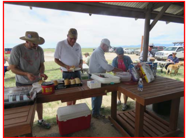
"The outside temps were getting hot but there were no complaints about the cold sandwiches and cold drinks for lunch!"

About 40 people attended, to include several people from other local RC clubs, Lunch was served from 11:00 to 12:00; Subway sandwiches, chips and side dishes brought in by volunteers. By 12:00, all the food and drinks were gone!