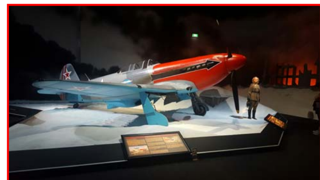
"Center - Ju-87 Stuka. Below - Yak-3." +++++