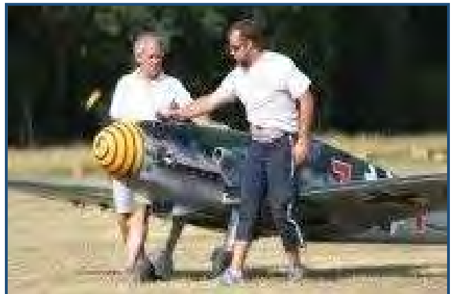
"Messerschmitt Me-109" Country - England