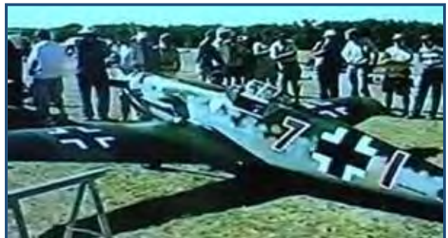
"Messerschmitt Me-109" Country - England