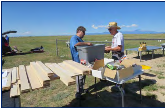
“Lots of good deals were happening all day.”

The event kicked off around 9:00 am, but people were already selling and flying long before the start time. Family Day was all about family members coming out, club members flying, people buying and selling RC items and everyone just having a good time.