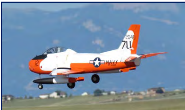
“This electric powered Navy jet was quite fast!”

Flying was permitted on both runways and all types of aircraft came out; jets, planes and even a few gyrocopters. So all the spectators that stopped by, got to see a wide variety of aircraft fly that day.