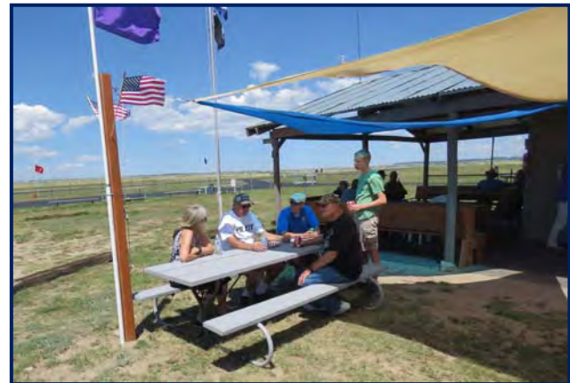
“It wasn’t very hot, but it was still nice to have shade while eating lunch.”

The event ended around 2:30 pm but the flying continued. Overall, it was very successful and Family Day & Swap meet continues to be the club’s biggest event.