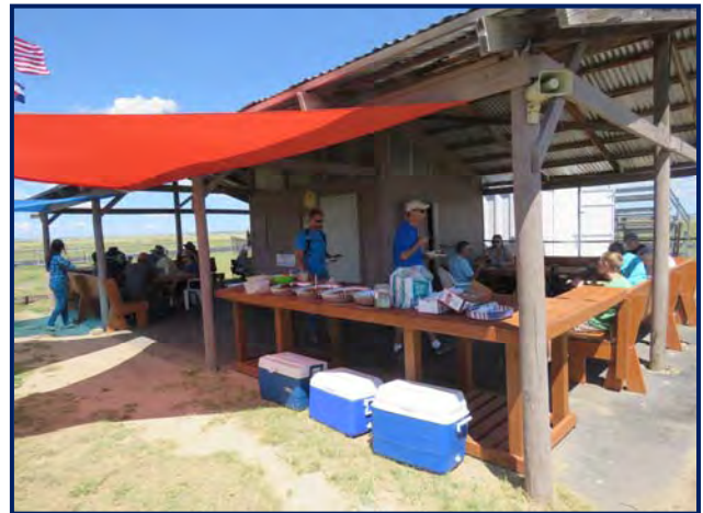
“Lunch was free for everyone, but donations to the club were welcome.”

Lunch began around 11:30 am. Fried chicken and baked chicken was the main course while club members brought in many of the side dishes. That turned out pretty good too, everyone had a selection of cole slaw, potato salad, egg salad, tangerines, beans and a variety of drinks to choose from.