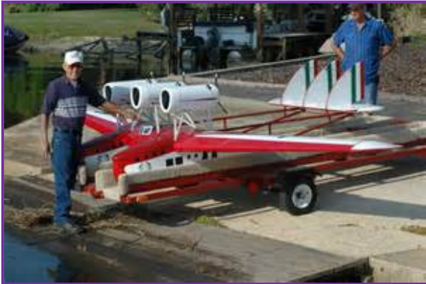
"Savoia-Marchetti S.66" Country - England