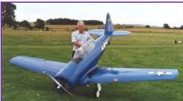
"North American AT-6 Texan" Country - USA +++++