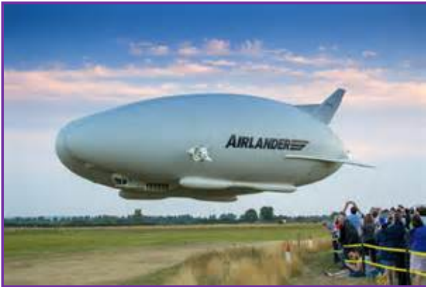
"The Airlander 10, nicknamed the Flying Bun."

The airship is designed to stay airborne for 5 days with a crew onboard or 21 days without a crew onboard.