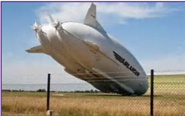
"The British press labeled this event as the world's slowest crash landing."

On August 24 th 2016, the Airlander 10 took off for its maiden flight (In England) and flew for about 15 minutes before the crew encountered problems. While still over open fields, the crew managed to land the airship in an open field, taking almost 15 minutes to reach the ground.