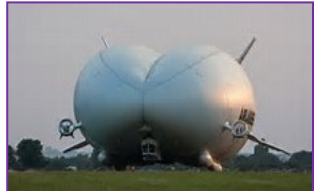
"From this view, you can see why the Airlander got the nickname the Flying Bun."