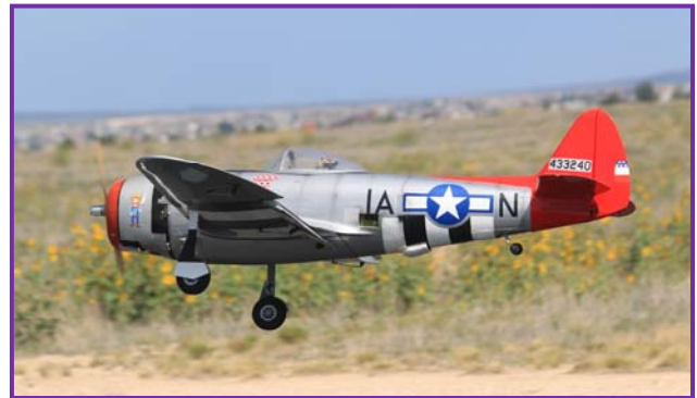
“PPRCC members Kevin (Left) and Dan (Right) roll their Eagles down the walkway in preparation for their first flights of the day.”