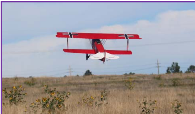
“Pueblo club member Larry Osborne was first to leave the ground with his Fokker DVII.”

The event kicked off promptly at 9:00 am, but it was still quite windy and it delayed many planes from leaving the ground. Fortunately, the strong winds were blowing right down the runway and in a short time a few pilots finally broke the ice and took off and flew without incident.