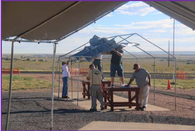
“Setting up shade is a necessity when flying at Pueblo during the summer!”

The Sky Coral RC club in Pueblo, held its 16 th annual Warbirds over Pueblo event during the Labor Day weekend. As usual, it was warm and windy but that did not deter dozens of pilots from participating, including a few pilots from the PPRC club.