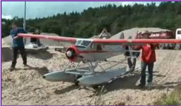
"De Havilland Beaver" Country - Australia