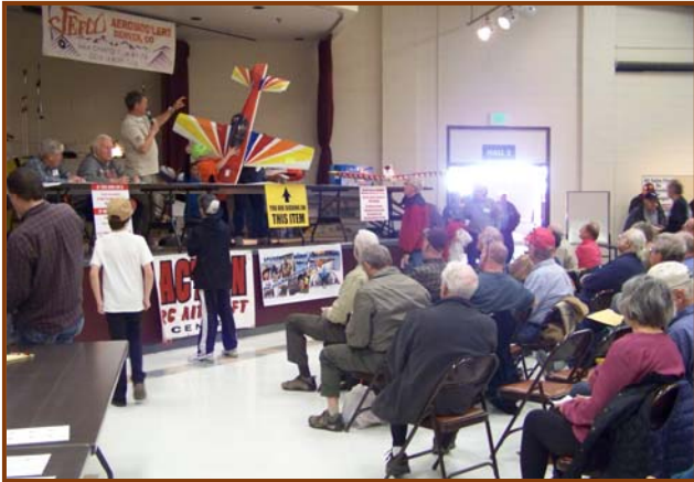
"The low amount of items for sale sold well because of the high amount of bidders."

Back in February, the Denver RC Modeler's club held their annual JEFACO auction and a few of our PPRCC members attended the one-day event. Even though attendance was high, items for sale seemed to have been at an all-time low. So I guess that made it a seller's market.