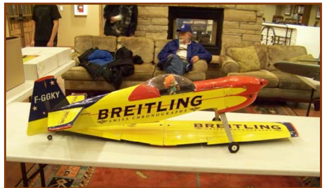
Top – Brand new Hanger 9 Corsair Middle – Electric powered Avro Lancaster Below – Breitling Aerobatic plane *****