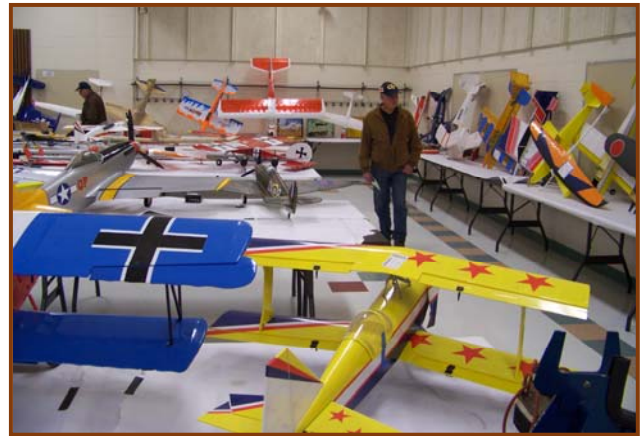
"This area is usually doubled in the amount of items shown here."