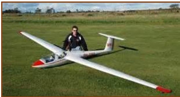
"ASK-21 Glider" Country - Germany