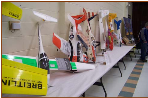
"The tables and walls are usually completely covered by airplanes for sale. But this year, airplane selections were light."

I stayed just for a few hours, browsing the tables to see what good deals that I might find. I did notice there were plenty of helicopters up for sale this year, maybe the owners were switching over to quads. However, I didn't see any quads for sale. I did see a few planes that I was interested in, but I decided to go home empty-handed, I already have enough airplane projects to attend to!