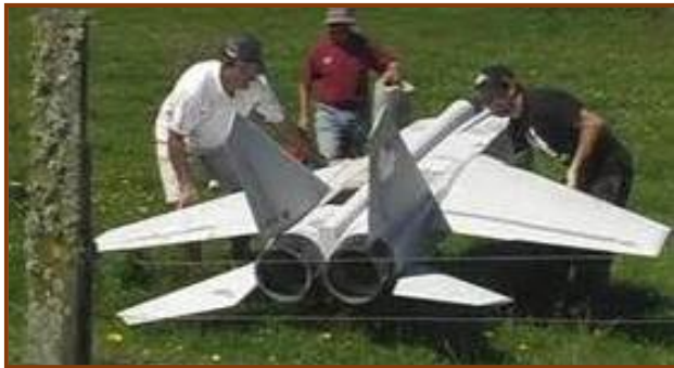
"Mig - 25 Foxbat" Country - New Zealand