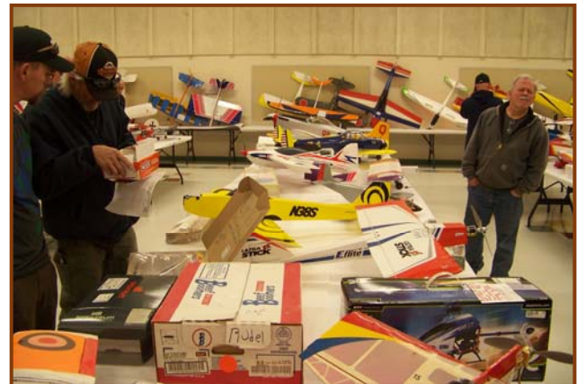
"There were plenty of pre-owned radios, engines and foamy airplanes for sale too."