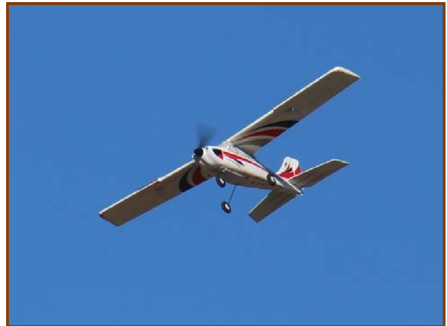
"The club's primary trainer plane, the Apprentice, is electric powered and flies great with new flyers and in windy days." +++++