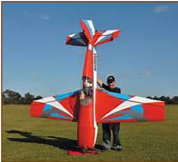
"Aerobatic Plane" Country - USA