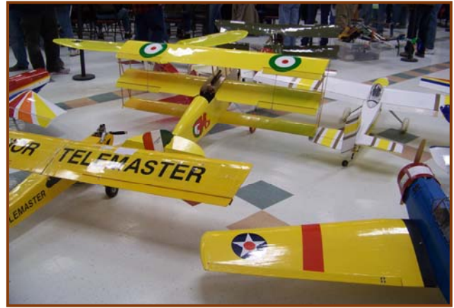
"The center floor had several large-scale planes for sale, most of them sold well."

I stayed just for a few hours, browsing the tables to see what good deals that I might find. I did notice there were plenty of helicopters up for sale this year, maybe the owners were switching over to quads. However, I didn't see any quads for sale. I did see a few planes that I was interested in, but I decided to go home empty-handed, I already have enough airplane projects to attend to!