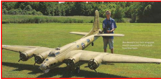
"Boeing B-17 Flying Fortress" Country - USA