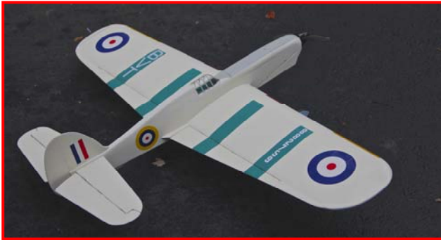
“Control-line Spitfire (above) and B-25 (below).”