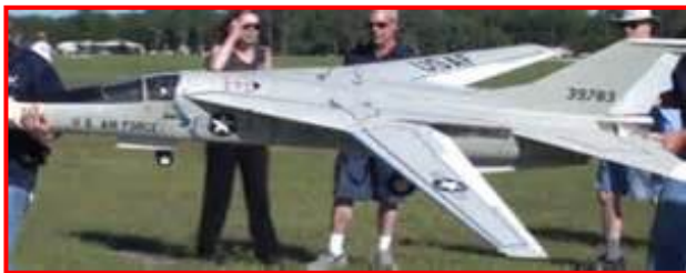
"General Dynamics F-111" Country - USA

(Top two photos from Dec issue AMA magazine) +++++