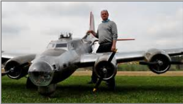
"Boeing B-17 Flying Fortress" Country - England