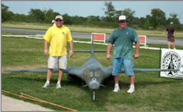
"Rockwell B-1 Lancer" Country - USA