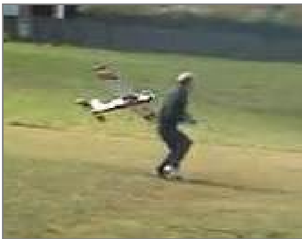
“Airplane vs pilot incident. Flying field USA.” +++++