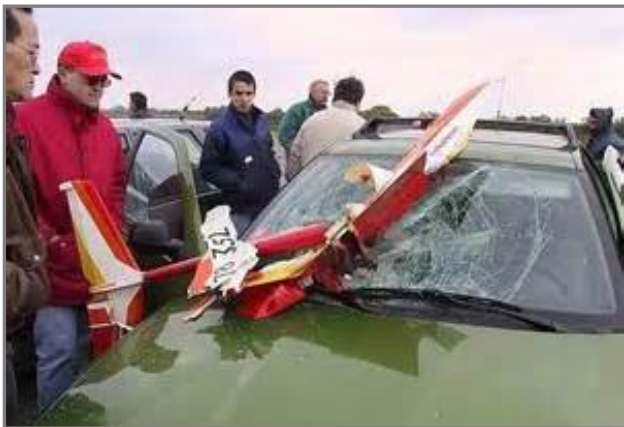
“Airplane vs car incident. Flying field, USA.”

Lots of rules to remember and follow but we all want to have fun without getting hurt or causing damage!