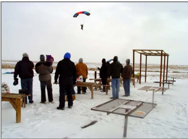
“For 2015, the club decided to have a parachuter drop in on during the Nitro-Chili event.”