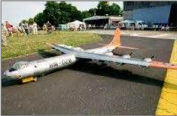
"Convair B-36 Peacemaker" Country - USA +++++