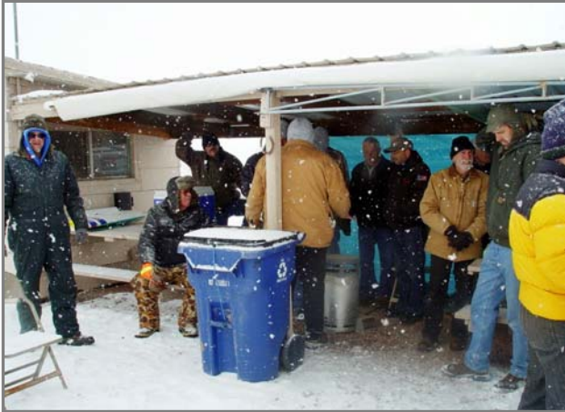
“Several FCRCC members did turn out for their annual fly-day and hot chili.”