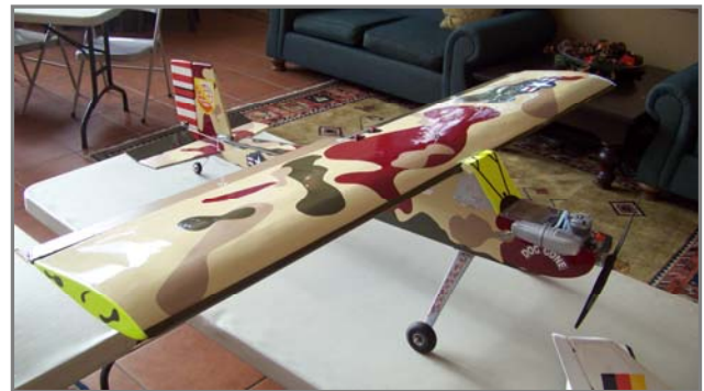
"Duane in his usual fashion, designed and built his own Cessna Bird Dog but renamed it Dog Gone. It is built with foamboard, covered in monokote and powered by an O.S. 55AX engine. Duane said that it weighs about 5 ½ pounds and looking forward to its first flight." +++++