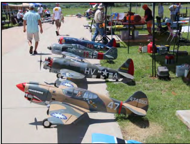
"This was just part of the squadron of planes that the Pueblo club brought up."

Both days were full of fun, food and flying with assorted airplanes from different eras of aviation history.