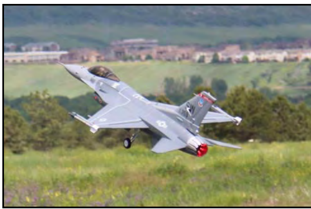
"This electric-powered F-16 even had after burner lights."

Another noticeable observation was that there were many more electric warbirds this year than in previous years. The quality and the details of electric aircraft has come a long way.