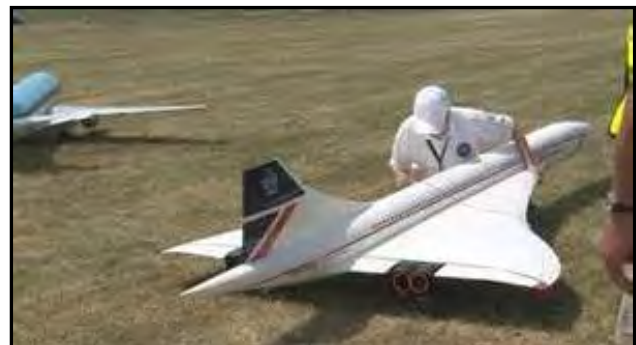
“British Airways SST” Country - England +++++