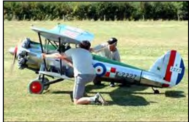
“Bristol Bulldog” Country - Ireland