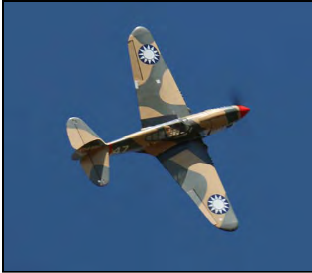
"This large-scale P-40 Warhawk belongs to one of the Desert Corral club (Pueblo) flyers."

There were a wide variety of airplanes and jets flying both days. Many of them were electric-powered too, just like the Warbirds over Denver event. But the Pueblo club stuck to their guns and flew their large-size, gas-powered warbirds with pride.