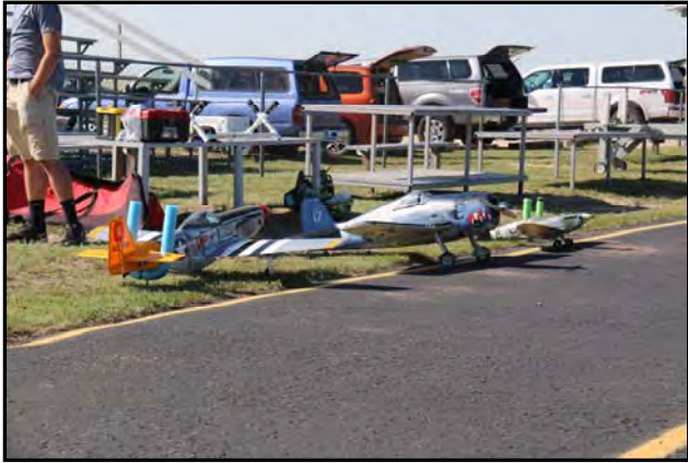
"Pilots began setting up early Saturday morning to get a good spot on the ramp areas."

Saturday started out as a very windy day but lucky for us, the winds were always blowing down one of the two runways, so it didn't stop many of the pilots from flying.