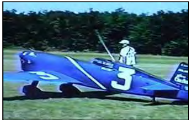
“Cauldron Racer” Country - England