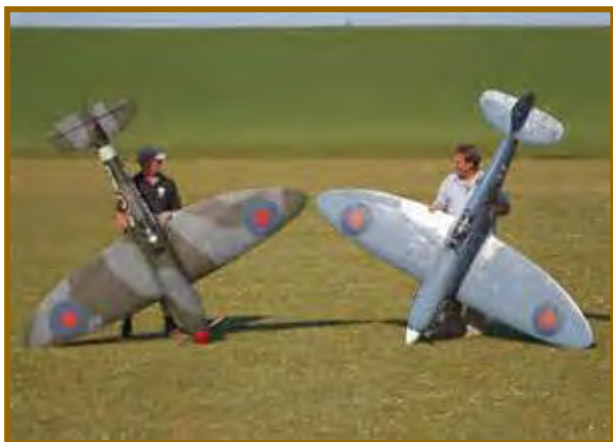
"Pair of Supermarine Spitfires" Country - England +++++