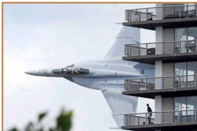
"Building sleeping quarters adjacent to the flightline can be a problem."