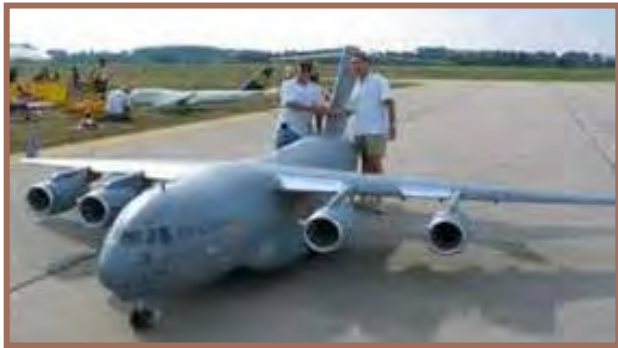
"C-17 Globemaster III" Country - England