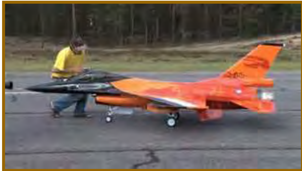
"F-16 Fighting Falcon" Country - Germany