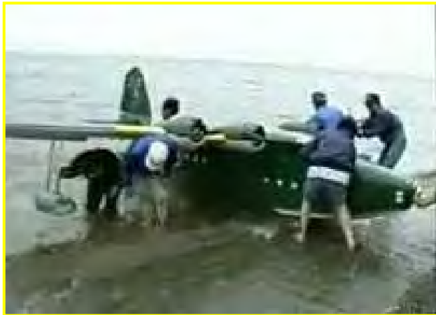
"H8K Emily" Country - Japan