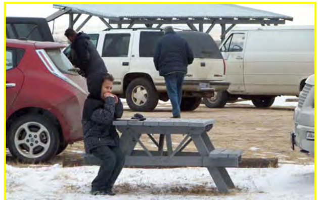
"And some people just came out for the food! Check out the club website for plenty more COOL pictures!"