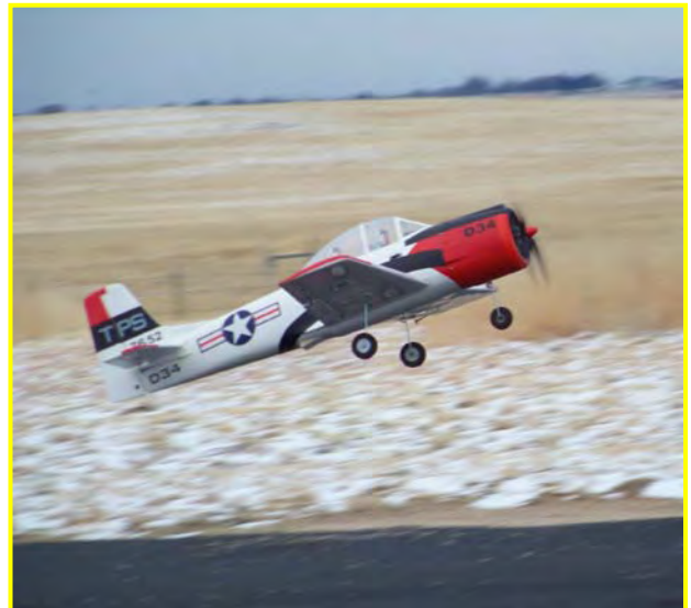
"The electric planes were quick and easy to set up, get a flight or two in, then throw back into the warm car!"