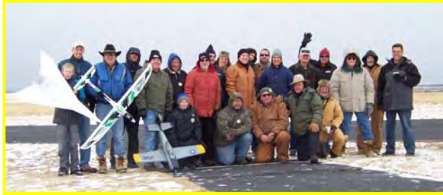
"Some of the 2015 PPRCC flyers that came out to start the new year."

Yes, it was a mere 13 degrees on January 1st, the day of our Frozen Needle-Valve event. But that didn't deter more than 30 flyers to come out and get their first flight of the year.