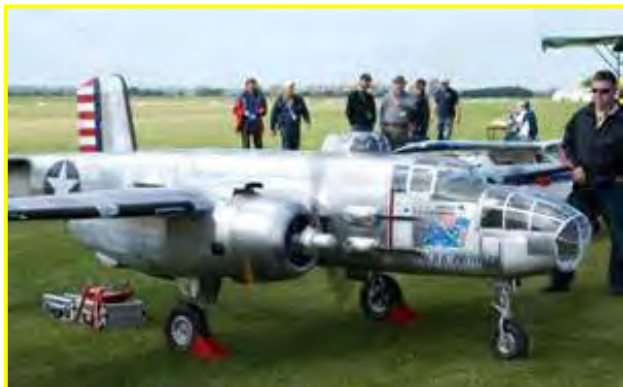
"B-25 Mitchell" Country - England