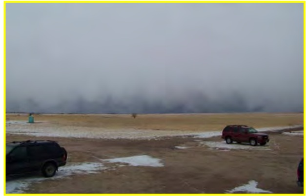
"A good shot of the approaching snow storm, just a mile or two away and approaching fast!"

After the group photo was taken around 10 am, surprisingly many people stuck round to almost noontime to continue flying or just to socialize. But by noontime, we could see a huge snow storm approaching from the south, heading our way. So that was the deciding factor for the remaining pilots to pack up their stuff and head for home!