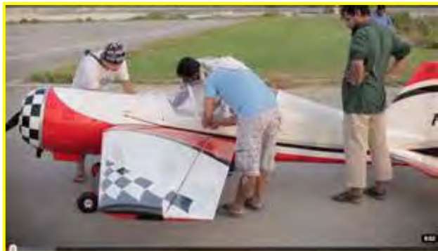
"Yak-54" Country - Germany