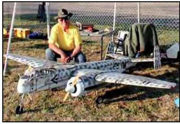
“RC model of the Heinkel He-219 Uhu.”