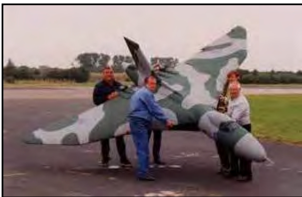
"Avro Vulcan" Country - England +++++