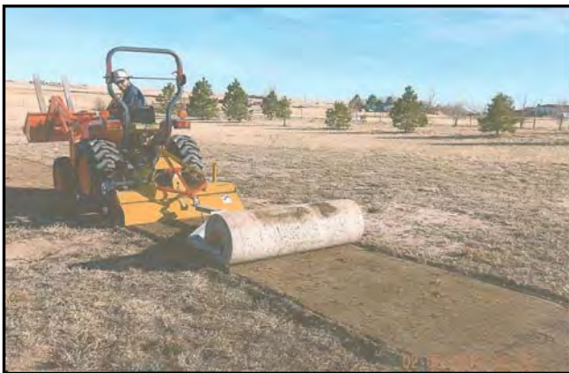
“Chuck Brath on his tractor, towing the roller. This is part of the plan to clear sides of the runways and then level it.”