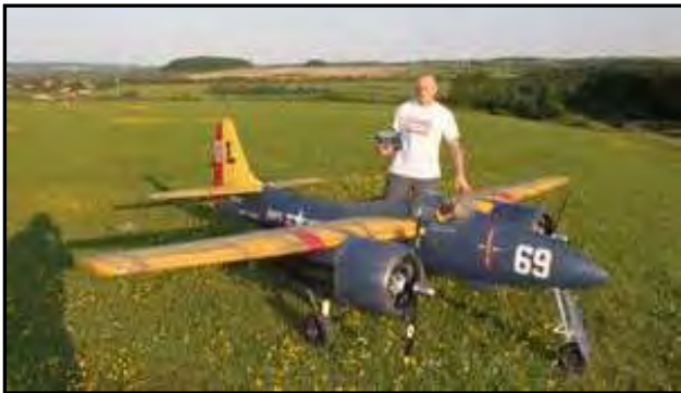
"Grumman F7F Tigercat" Country - England