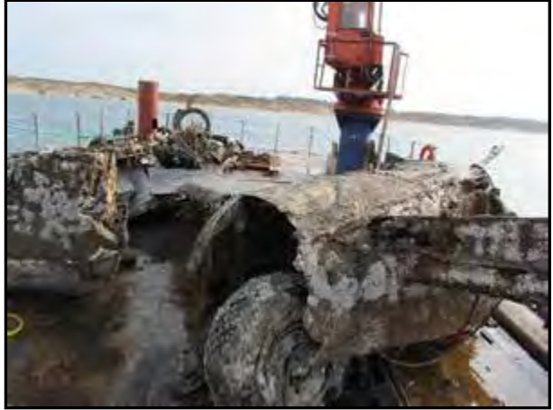
“Despite being in bad shape, recovery operations were not that difficult, as the plane was only in eight feet of water and just off shore.”