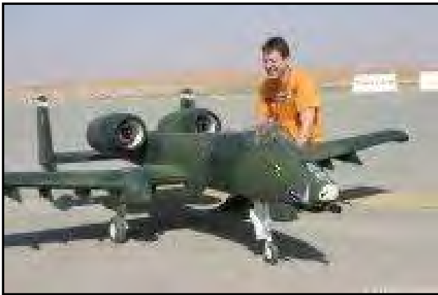
"A-10 Thunderbolt II" Country - USA