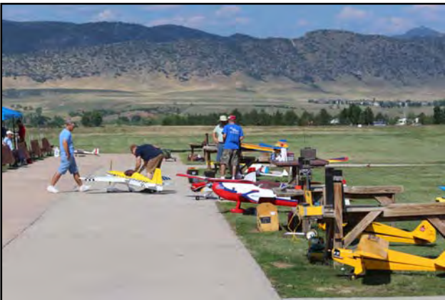
"You can see several of the assorted types of planes that were involved in the Big Birds event. It cost $10 for pilots to register and about 25 pilots signed up."

The event kicked off around 9:00 am, lunch was served around 11:00 am and the event ended around 2:00 pm. Surprisingly the weather remained nice and flyable most of the day.