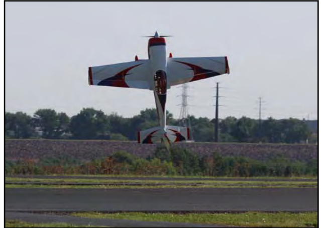
"This pilot really put his plane to the test, including scraping off the top of his rudder in an inverted pass later on during the day."

There were several giant aerobatic planes that did a great performance throughout the day, but in the end most of the old-time flyers really enjoyed the Cubs, the Telemasters and the Talyorcrafts just cruising around.