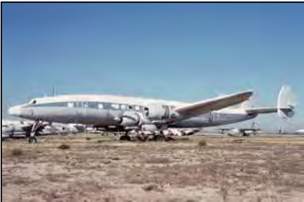
"Columbine II was located at an Arizona airport and was purchased for restoration."

A number of aircraft types have been used as Air Force One since the creation of the presidential fleet, starting with the 3 Lockheed Constellation's in the late 1950's "Columbine I", "Columbine II" & "Columbine III" respectively. It also has including two Boeing 707s introduced in the 1960s and 1970s, respectively; since 1990, the presidential fleet has consisted of two Boeing VC-25As – specifically configured, highly customized Boeing 747-200B series aircraft. The Air Force is looking into replacing the two VC-25 aircraft with three replacement aircraft beginning in 2017.