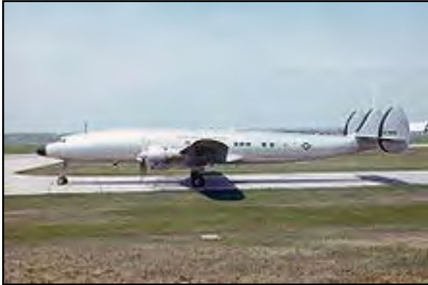
"The Lockheed Constellation was designated as USA's first Air Force One airplane."