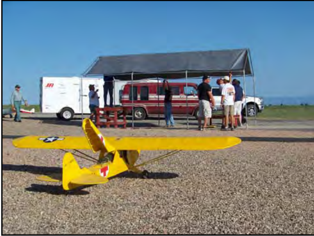
"Pilots arrived early to claim their spots for the weekend."