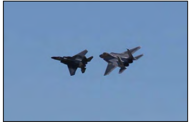
"Kevin (lead F-15) and Dan (trail F-15) completed several flights both days during the event."

Several pilots brought more than one plane, so there was a large assortment of warbirds flying and on display. Dan and Kevin had the only two turbine jets flying in the event, so they pretty much stole the show both days. Pilots and spectators stopped what they were doing to view the pair of jets in action.