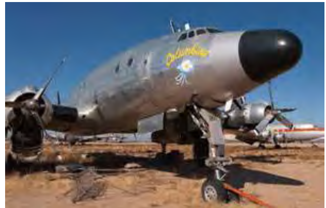
"VC-121 Columbine II seen in 2005 sitting at the Marana Regional Airport, Arizona."

https://www.youtube.com/watch_popup?v=ehwvZXVKmPU