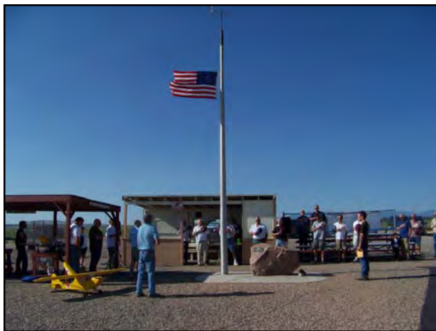
"The event kicked off with one of the Sky Corral members singing the National Anthem. He was pretty good!"

It was the usual Pueblo weather, hot then windy or windy then hot! But it didn't prevent the 30+ pilots from flying throughout the weekend and just to come out and have a good time.