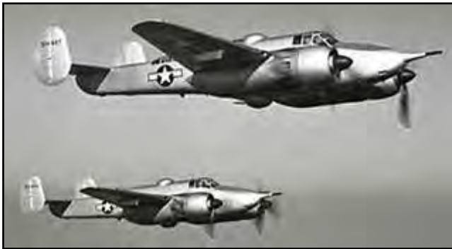
“Only two XA-38 prototypes were built, one went to the scrap yard and the location of the other one is not known.”

The XA-38 Grizzly had a crew of two, a pilot and gunner, was armed with a single 75mm cannon in the nose, four forward firing .50 cal machine guns, two .50 cal machine guns in the ventral turret and two .50 cal machine guns in the dorsal turret.