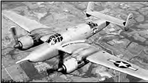
“The XA-38 Grizzly. Heavily armed and armored, it was designed from the ground up as a ground attack airplane. “

With those guidelines in mind, in 1945 the Beechcraft aircraft company came up with the XA-38 Grizzly, America's first attempt at a heavy ground attack airplane.