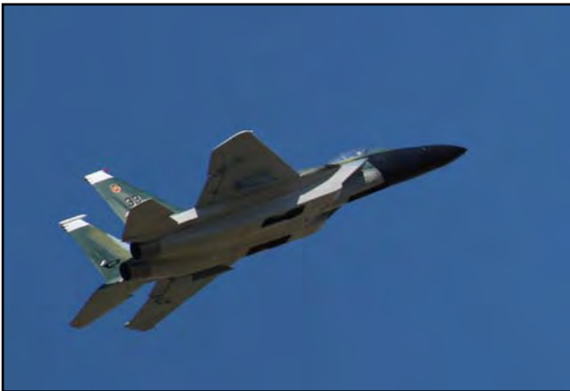
"Kevin's F-15 Eagle begins a climb as it finishes a high-speed pass down the runway."

Pilots flew throughout the morning as curious passing drivers dropped in to see what was going on. They were quite impressed of the speed of the planes and jets as they flew over the runway. Several of the spectators did not realize that there was an airfield nearby until a RC jet had just flew over them!