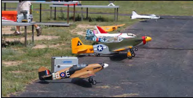
"Some of the electric warbirds that participated."

Back in July, the club completed its annual Electric Fly-In with a modest turnout of pilots to include a few pilots from Pueblo and a few pilots from Denver. Even the weather was corporative, at least it was until 1:00 pm!