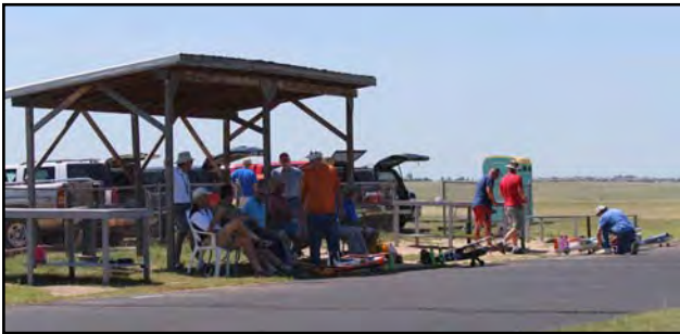
"Several of the spectators and pilots took advantage of the limited shade when the sun really got warm!"

The event kicked off around 9:00 am with a welcome to all pilots followed by a pilot's brief. After that, the flightline was open and it was time to fly.