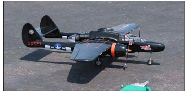
"This ASM P-61 Black Widow was awarded 1st Place Best Electric airplane."

Pilots stayed busy all morning flying their electrics, taking pictures or talking with other pilots about their electric projects. So it turned out to be a good meeting place to learn more about the world of electric flying.