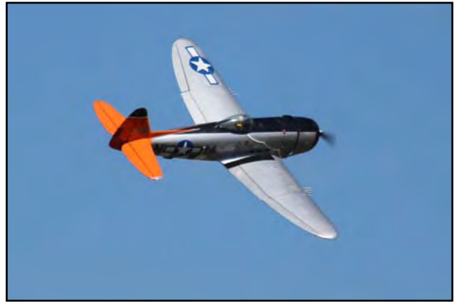
"This Top Flite P-47 Thunderbolt was awarded Best Scale Military airplane."