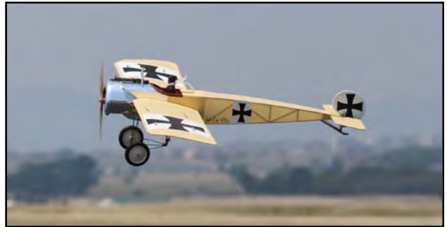
"This German Eindecker was awarded 2nd Place Best Electric airplane."